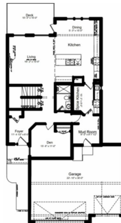
Main Floor Plan