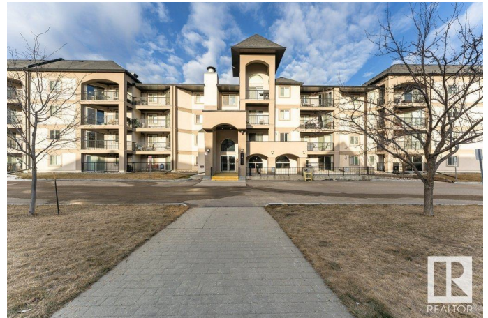
13111 140 Ave NW, Edmonton, AB