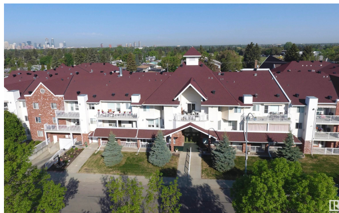
321-3220 Fulton Rd NW, Edmonton, AB