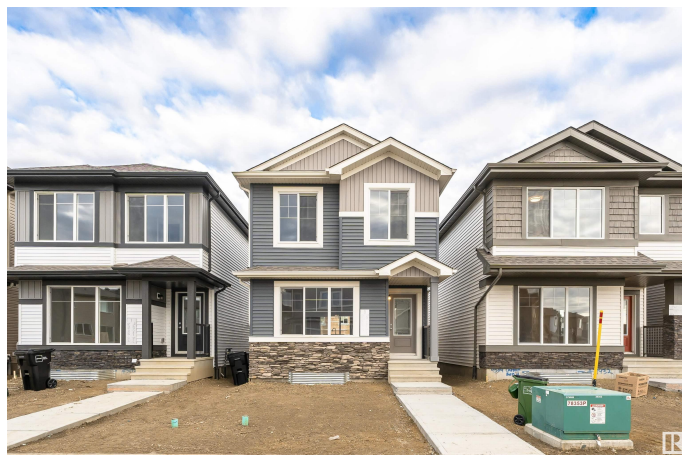
9566 Carson Bnd SW, Edmonton, AB

Main Floor Exterior Area 65.32 m 2 Interior Area 59.37 m 2