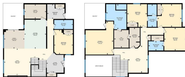
Main Floor Exterior Area 1281.25 sq ft

Main Building - Total Exterior Area Above Grade 2348.01 sq ft